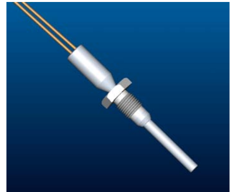
Chromium Oxide / Yttrium Chromite NTC R/T